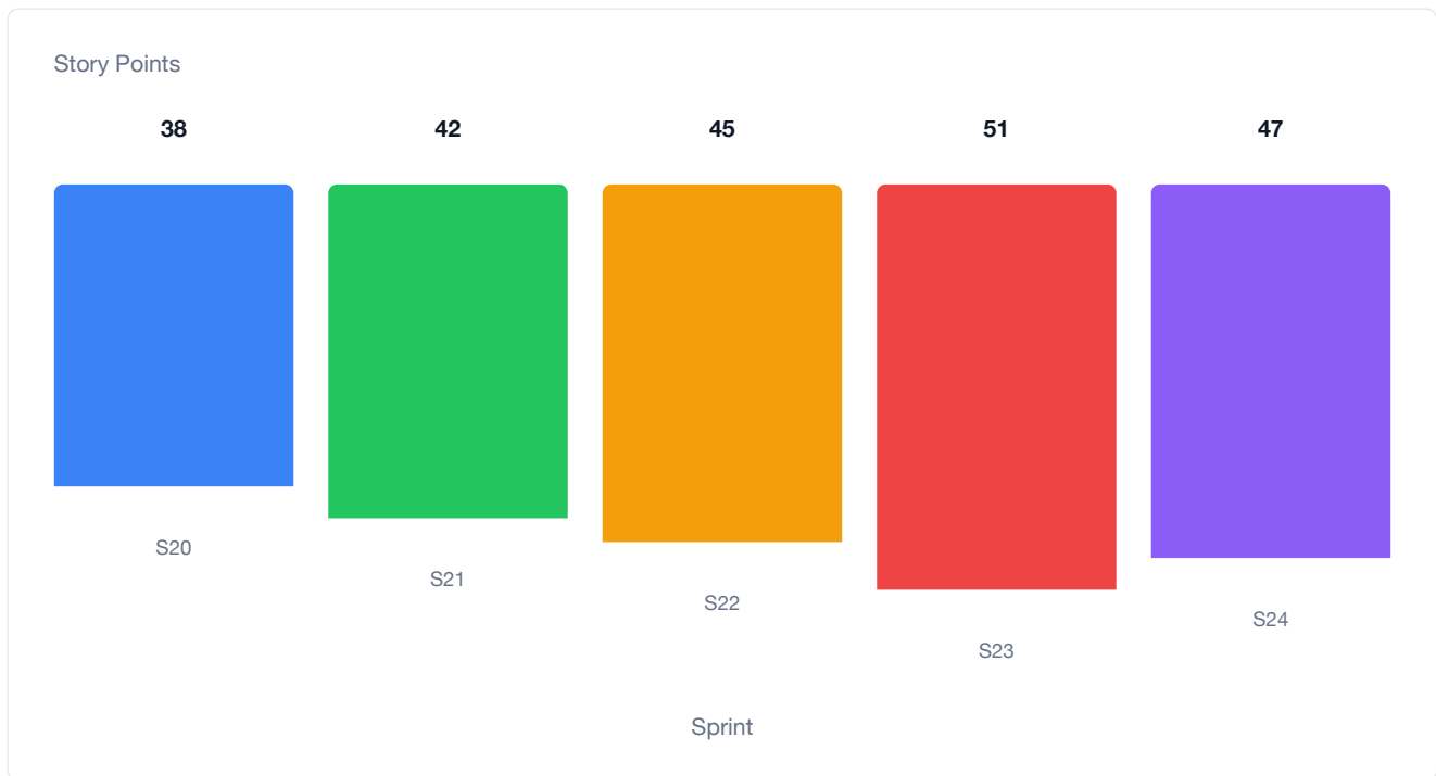
Story Points per Sprint