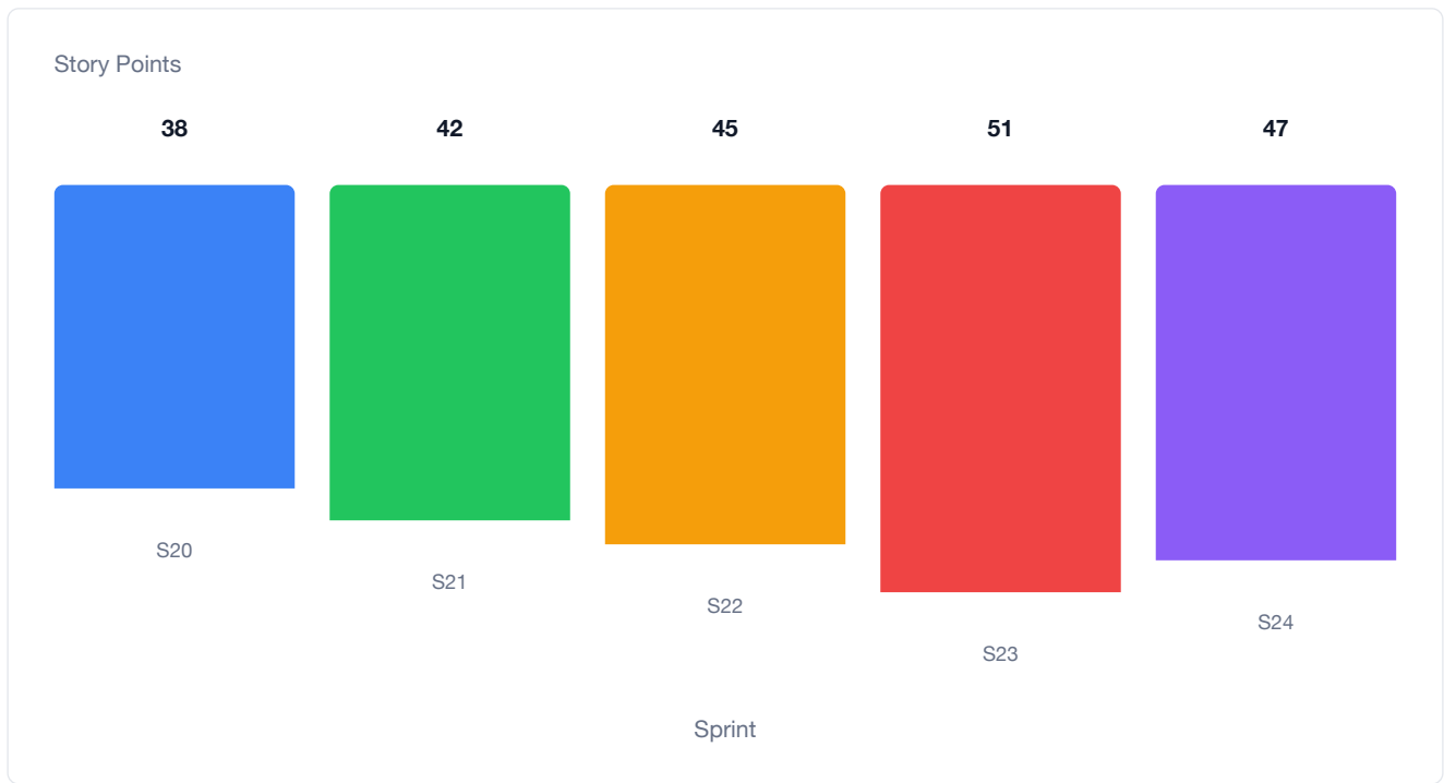
Story Points per Sprint